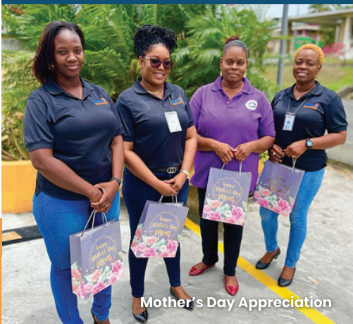
Mother's Day Appreciation