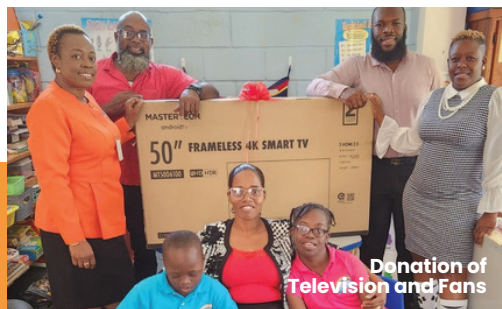
Donation of Television and Fans