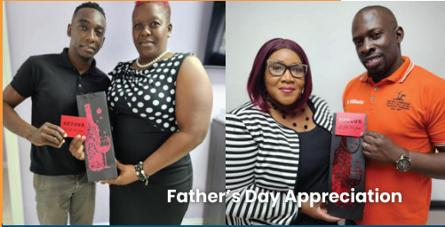
Father's Day Appreciation